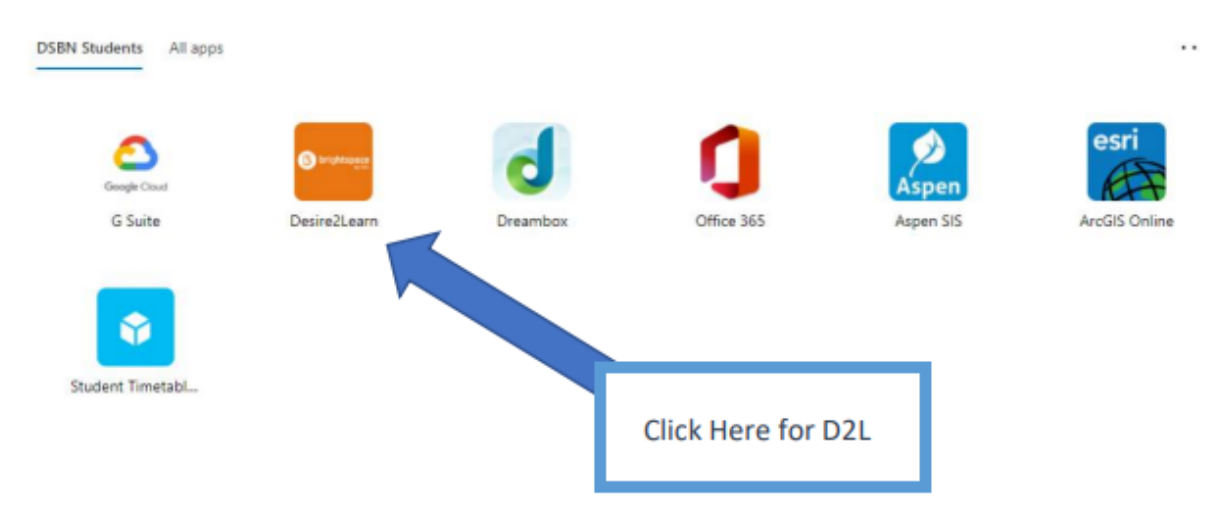
Step 2: Find the D2L icon and click to enter.